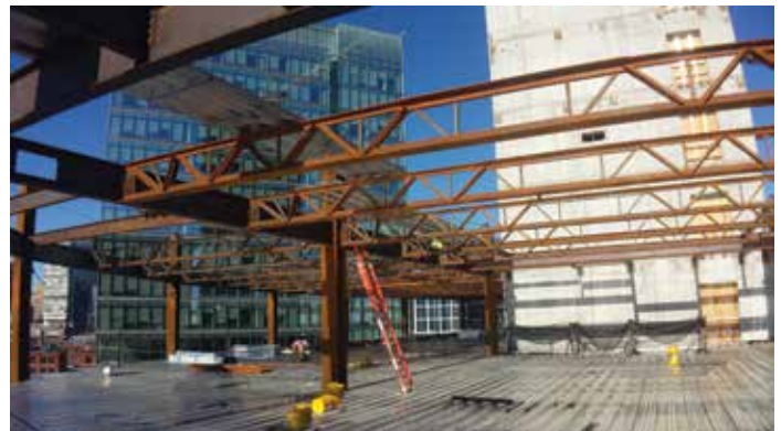
Vierendeel openings at midspan allow for a large chase of ductwork.