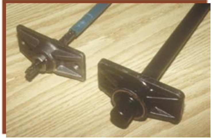
Fixed-end anchors. Anchor on the left is non-encapsulated. Anchor on the right is encapsulated.

This article provides a brief overview of unbonded post-tensioning repair. The repair procedures are essentially the same whether the strand has corroded or has been cut. The objective is generally to splice the strand so that it can be retensioned.