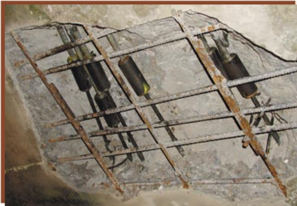
Splice chucks in a partial-depth overhead access hole.

If a tendon has been stressed properly, the elongation will be approximately 8 inches per 100 feet. Once the elongation has been verified, the strand extending through the anchorage is cut off about 1/2 inch past the wedges and the stressing pocket is grouted. If the tendon is encapsulated, a cap is placed over the wedges and strand tail before the pocket is grouted.