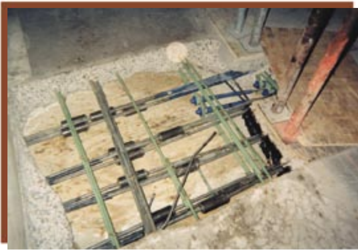
Splice chucks in full-depth access hole. Anchors on the right are fixed-end anchors for partial-length tendons.