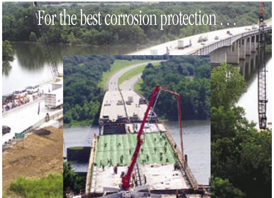
I-40 Bridge Webbers Falls, OK