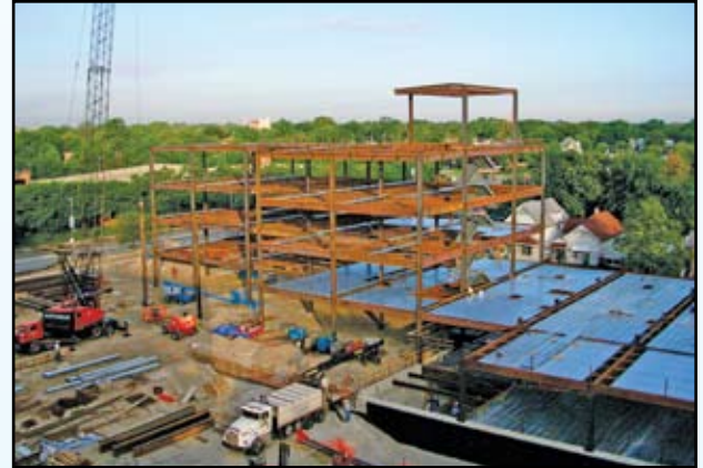
During construction, sequencing was extremely complex. The site was very tight, with no lay down or storage areas, and minimal space for the crane and for receiving material. The structure had to be built using the just-in-time delivery method. Construction expertise during the planning stages facilitated execution of this critical aspect of the project.

delivered to the site, and erected in sequence. During erection, the crane progresses from one end of the building to the other, setting each piece of steel in sequence — with no comeback work. After the material is set by the raising gang, the plumbing and detail gangs bolt, plumb, weld, etc. the structure in the same sequence. The metal deck and shear studs are installed closely behind the detail gang, followed by placing the concrete slab. The other trades follow with everyone working the project plan, on schedule and within budget.