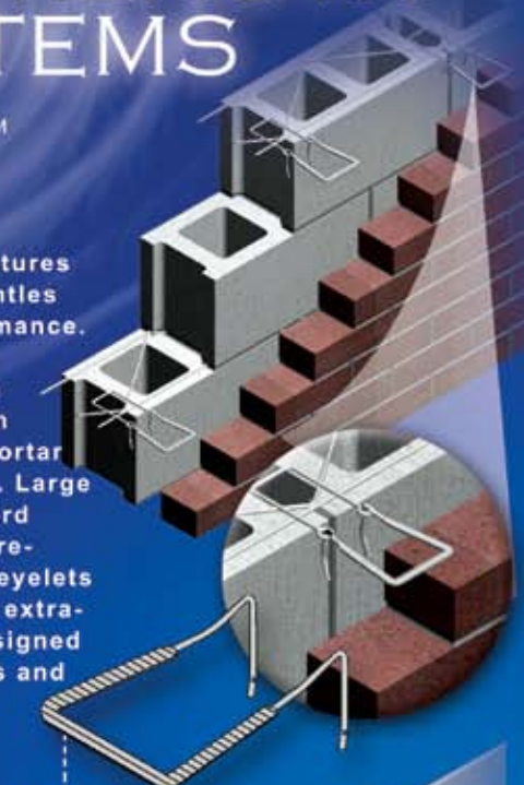
Pintles are flattened and serrated for superior bonding with mortar.

Ideal for usage when the offset of engagement between pintle and anchor is greater than 1-1/4". Standard leg length will accommodate up to 2" offset while maintaining sufficient strength.