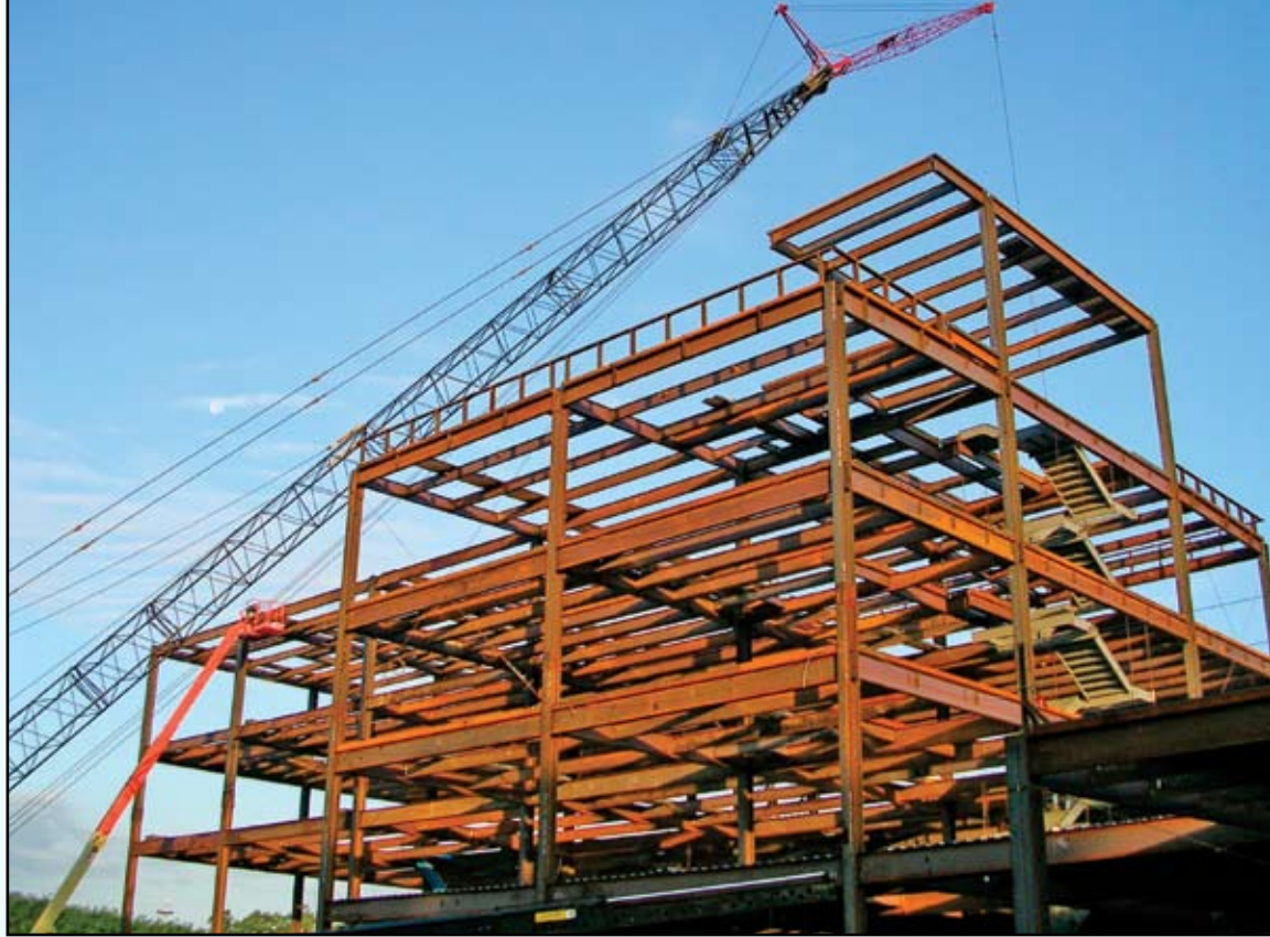
Facing a very tight construction schedule, Mercy Health Partners incorporated a Structural Engineer and Fabricator/Erector into the planning team. Design began in January 2005 with the initial architectural concept drawings. Erection of the main steel framing was completed in October 2005 - ten months from architectural concept to final bolt-up. Mission accomplished.