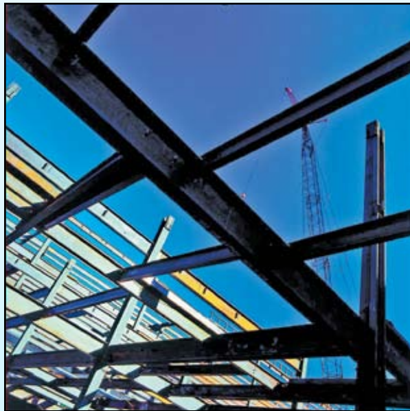
Using Constructability principles, the Mercy Heart Center Design/Build team shaved 16 weeks from the schedule and 140 tons of steel from the structure of the four-story, 144,000 square foot facility.

Without experience, “one does not know what one does not know.” The problem with experience is that it takes so long to acquire. Therefore, involving a Constructability Consultant in the preparation of the Contract Bid Documents delivers tremendous benefits to the Owner. Coordination begins with the Architect and the SER and other design disci-