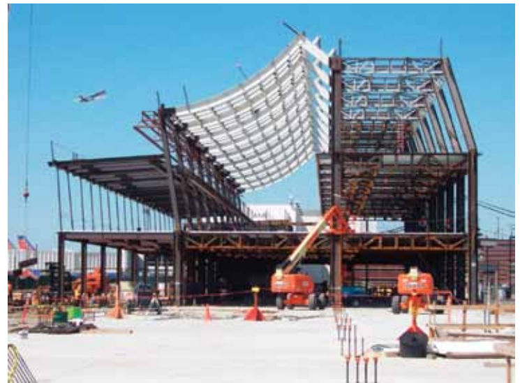
Figure 2: Following careful evaluation of options, a unique earthquake-resisting structural system known as a special truss moment-resisting frame (STMF) was selected, in a first-ever use at an international airport. The STMF system, which uses steel trusses to resist gravity, seismic, and wind loads, is cost effective, quickly erected, seismically robust, flexible, and adaptable.