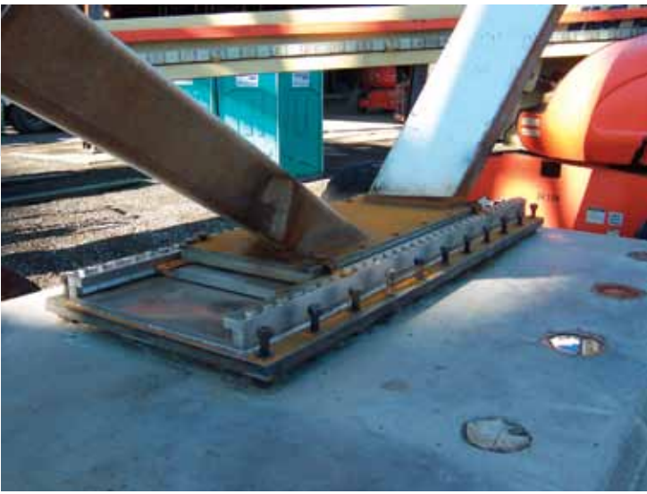
Figure 4: The arched roof ribs of Terminal B are supported on three Teflon-coated bearings which allow the terminal roof to slide in the event of a major earthquake.

finalized until construction of the structure was well underway, Hensel Phelps has seen a substantial reduction in field changes attributable to interferences between separate systems. The BIM model was also very effective during installation of the intricate baggage conveyor system, shortening the installation time substantially.