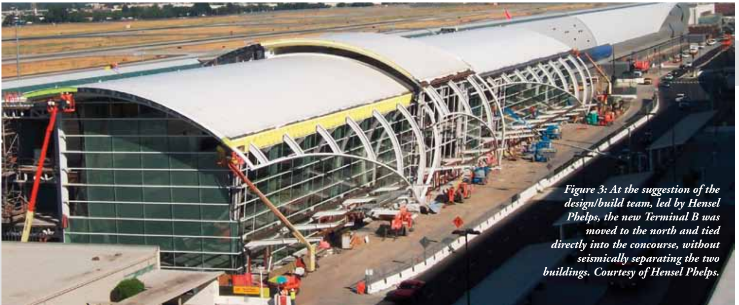
Figure 3: At the suggestion of the design/build team, led by Hensel Phelps, the new Terminal B was moved to the north and tied directly into the concourse, without seismically separating the two buildings.